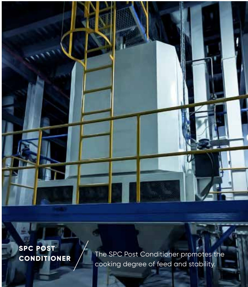
SPC POST CONDITIONER

The SPC Post Conditioner promotes the cooking degree of feed and stability.