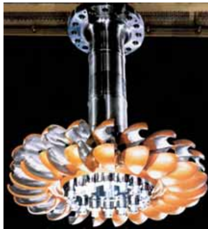
Pelton type runner

The main equipment components will be produced in India, at VA TECH HYDRO India Pvt. Ltd. in Bhopal (electrical equipment & generators) and at VA TECH Flovel Ltd. in Prithla near Delhi (mechanical equipment, turbine parts and main inlet valves). The Pelton turbine runners will be