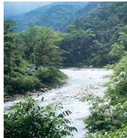
Teesta river near the power station

Eric Aegerter Phone +49/751 83 3562 eric.aegerter@vatew.de